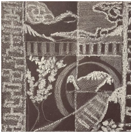
Winnie Chen, 14, grade 8 St. Therese Chinese Catholic Sch.